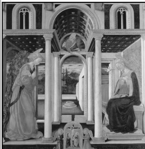
The Annunciation (Neri di Bicci) c. 1460