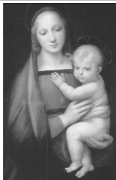
Recessional Marian Antiphon