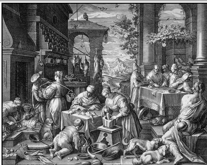
Lazarus in the House of the Rich Man (14th Century Woodcut)

A lleluia. Paratum cor meum, Deus, paratum cor meum: cantabo, et psallam tibi gloria mea. Alleluia My heart is ready, O God; I will sing, sing your praise